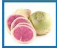
** Watermelon Radish 985-8887 | 1/5 lb 981-2502 | 5/5 lb