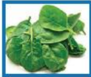
**** Spinach Clean & Trim 980-3232 | 4/2.5 lb