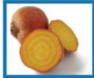
** Beets, Gold V/F 985-8027 | 5/5 lb