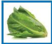
***** Trueharvest One Cut Romaine 983-1010 | 1/18 ct