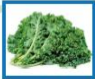
** Lettuce, Kale Green 981-5275 | 1/6 ct 981-5267 | 4/6 ct