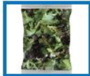
***** Trueharvest One Cut Truemix 980-6667 | 4/1.5 lb