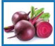
** Beets, Red V/F 984-0020 | 5/5 lb