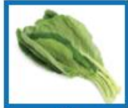
** Collard Greens 980-0194 | 1/12 ct