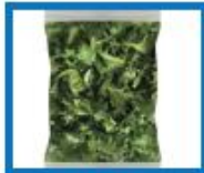
***** Trueharvest One Cut Crispy Leaf 980-6665 | 4/1.5 lb