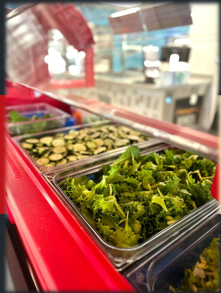
Manor ISD– True Harvest Lettuce