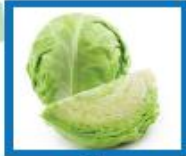
** Cabbage, Green 06-8838 | 1/2 ct 980-0067 | 1/sack ea