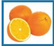
*** Oranges 980-5020 | 1/40 lb