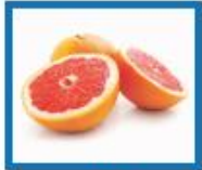
*** Grapefruit, Ruby 980-4147 | 1/5 lb 980-4097 | 6/5 lb