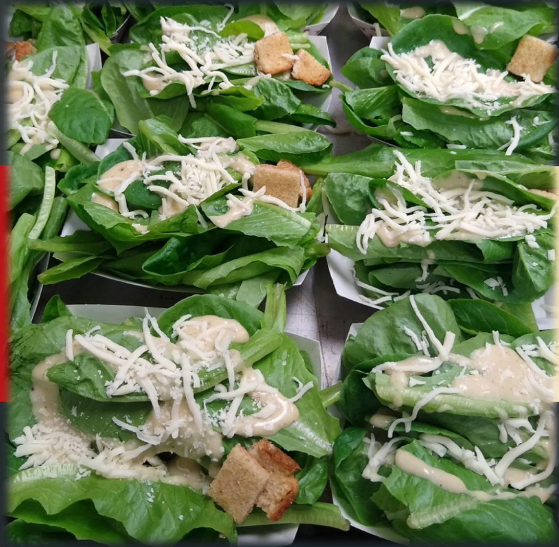
Community ISD– True Harvest Lettuce