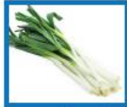
** Leek, Fresh 06-8305 | 1/12 ct