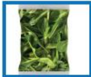
***** Trueharvest One Cut Romaine 980-6664 | 4/1.5 lb