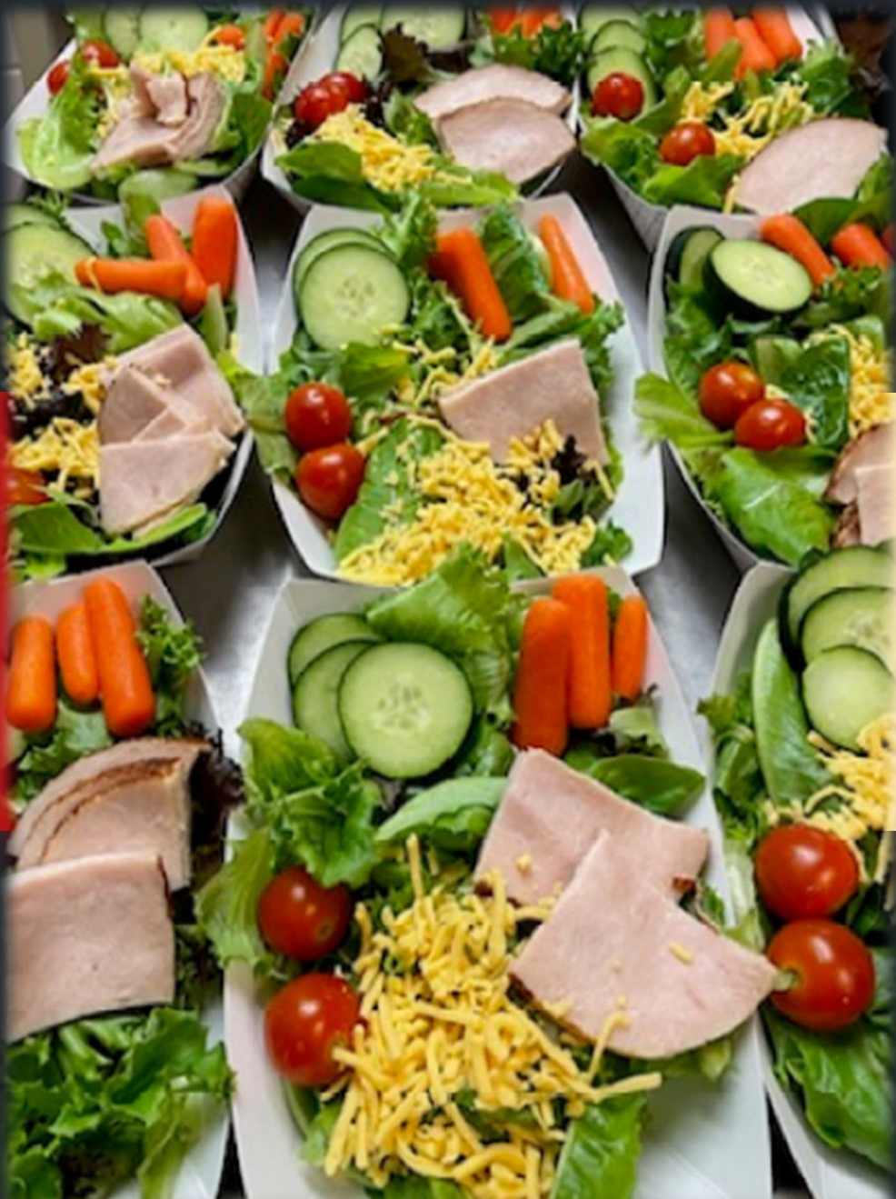
Community ISD – True Harvest Lettuce